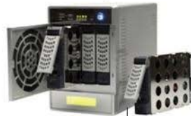
Network Attached Storage